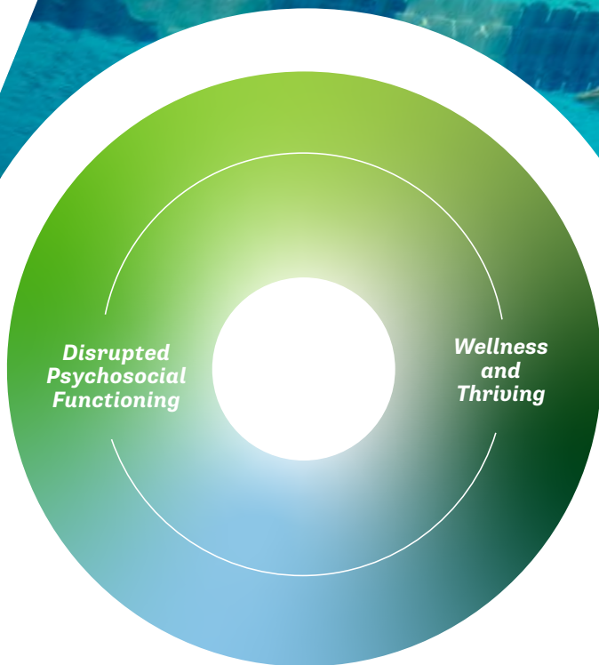
Fig. 1: The spectrum of mental health represents many possible states of well-being. Resilience and thriving may indicate optimal mental wellness, while impaired function and performance may indicate a student-athlete in need of mental health support.